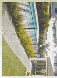
Private Community Recreation