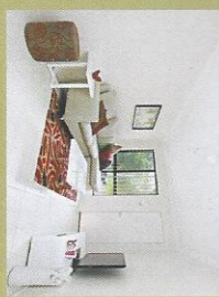
Open Plan Living